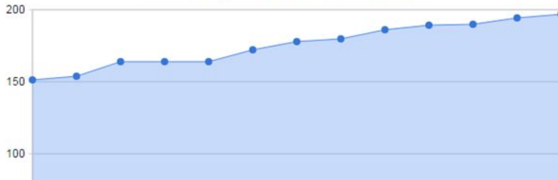
Total and Active Members

We're about sharing tips on looking for a job, getting a better job or learning new skills to advance in your current job. The meetup has been around for about 18 months, has 202 members and about 34 active members. About 30-50 people attend annually.